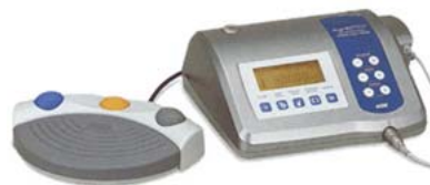
Specialised "driver" for the burr with controls for the surgeon to control the instruments direction of rotation, speed and torque.

Picture demonstrating the position of the foot for surgery with the xray machine providing the surgeons "vision".