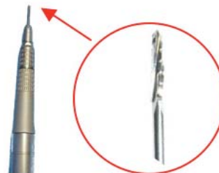
High speed 'pencil' burr used.

At the end of the operation, stitches are not usually required. The surgeon will inject local anaesthetic around the ankle to make the foot feel comfortable after surgery. The foot is wrapped up in a dressing and bandages. The operation is performed as daycase surgery.