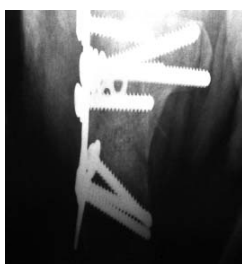
Further axial xray view showing accurate reconstruction of the shape of the calcaneus following fracture.

Fractures of the calcaneus (heel bone) can be very debilitating injuries. When the heel bone is fractured (broken), it is usually caused by tremendous forces impacting on the heel such as with falls from a height, or motor vehicle accidents. You can imagine what happens if you stand on an orange, and this is in effect what happens to the calcaneus in such injuries. The calcaneus is essentially squashed flat, tilts inwards and widens.