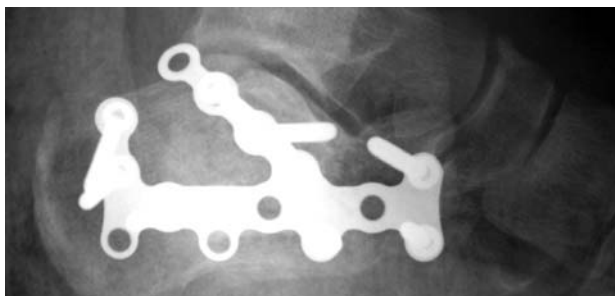
Xray image of an actual fracture of the calcaneus after reconstruction using a specialised plate and screws). Note the reconstruction of height and shape of the bone and subtalar joint.